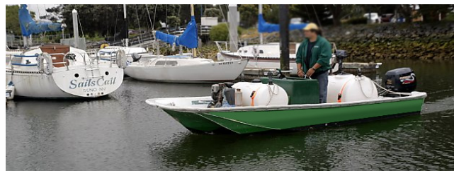
Custom vessel colors available