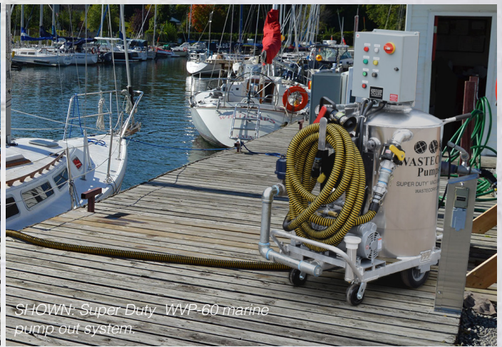
SHOWN: Super Duty WVP-60 marine pump out system.