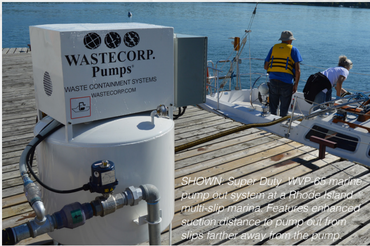
SHOWN: Super Duty WVP-65 marine pump out system at a Rhode Island multi-slip marina. Features enhanced suction distance to pump out from slips farther away from the pump.