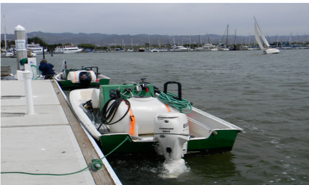
Custom tank, pump controls and hose stand configurations available